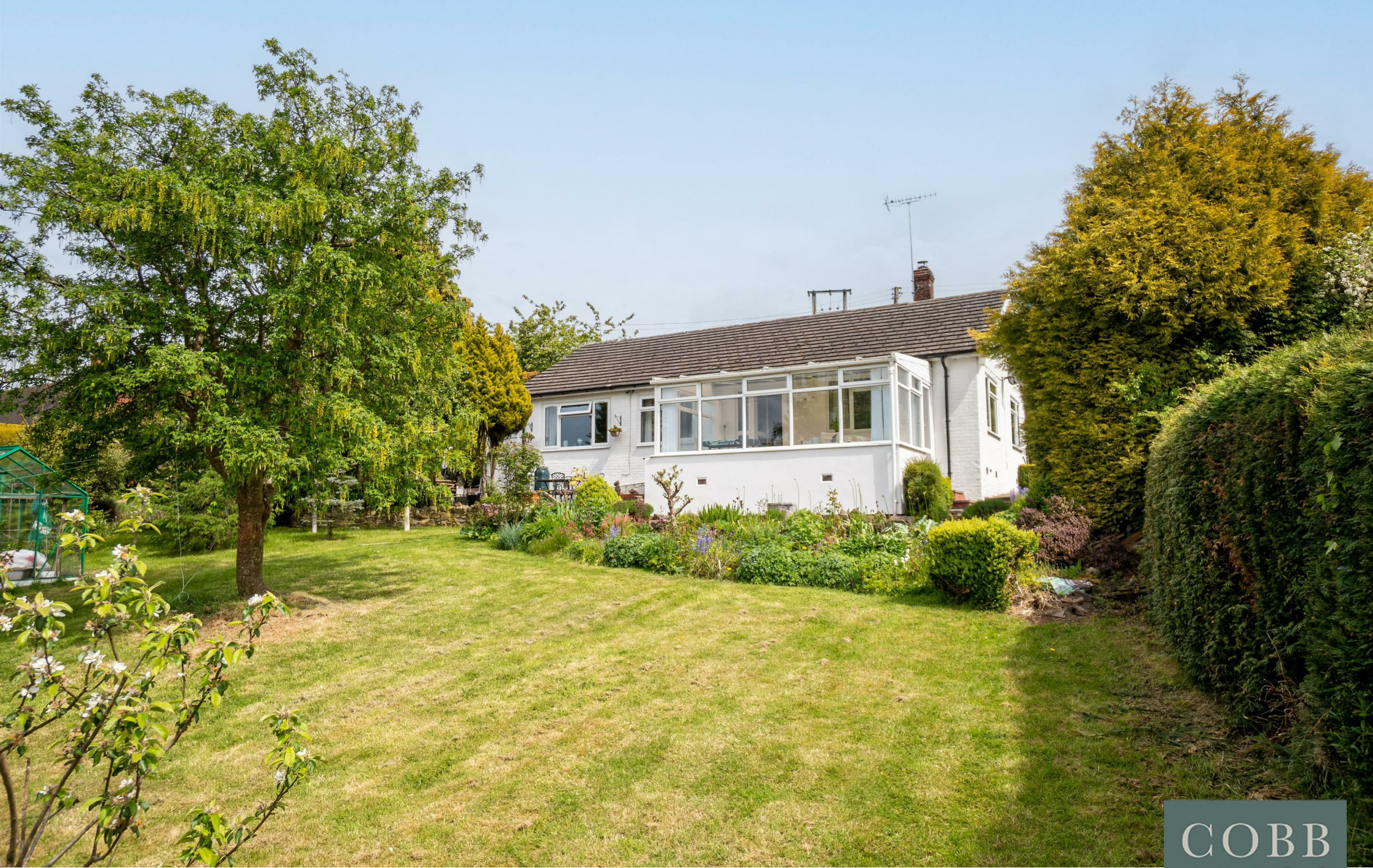
Mid Bank Bungalow, Angel Bank, Ludlow, SY8 3HY Price £350,000